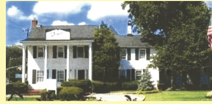
Family Owned and Operated